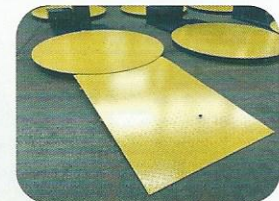
LOADING RAMP* (* on request)