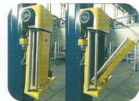
200% POWER PRE-STRETCH* (* on request)