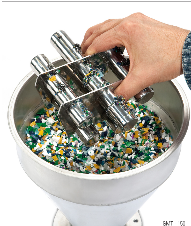
GMT - 150