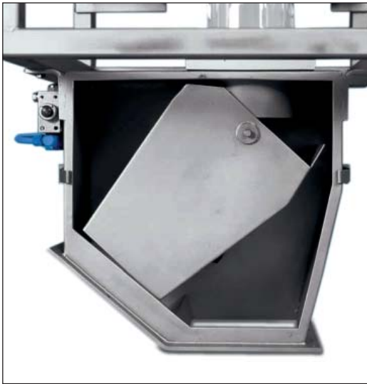
Separation unit with opened cleaning flap.

The RAPID 6000 metal separator primarily is used in industries with high hygienic demands.