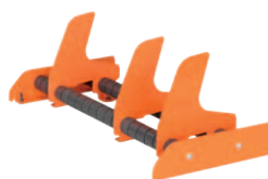
Film roll with split roll technology and guiding plate