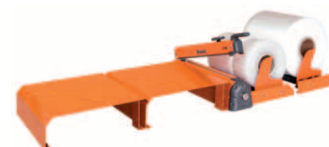
Typical application: double working table and double film roll