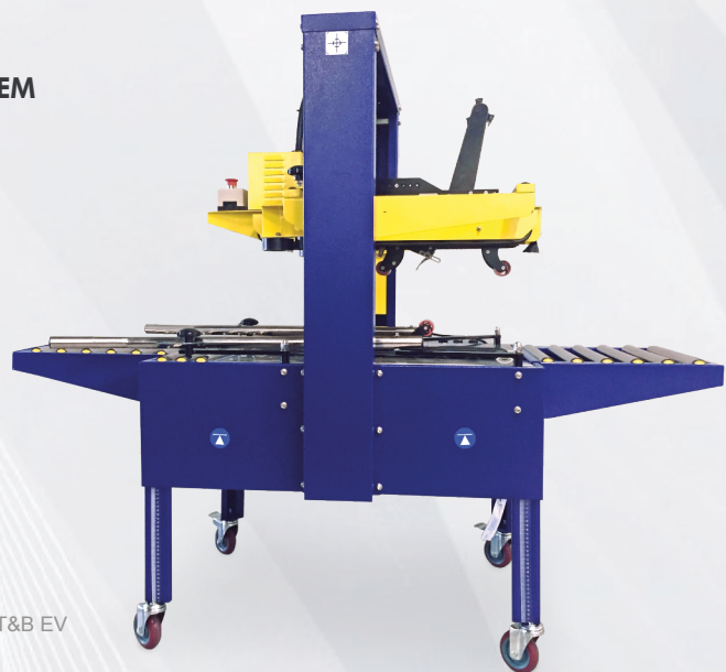
NASTROPACK T&B EV