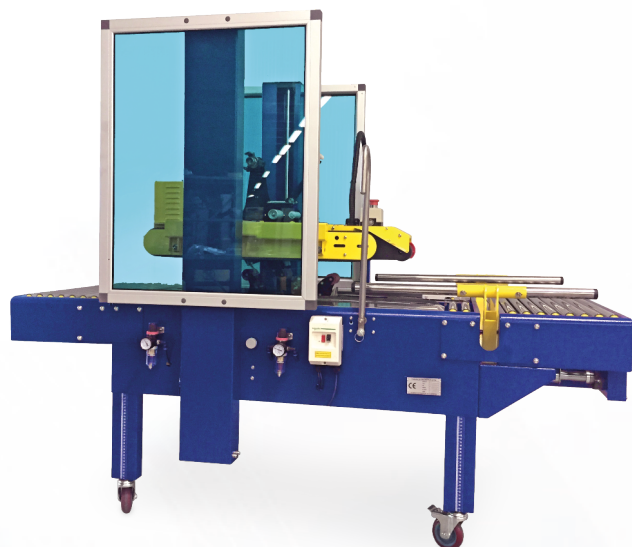
NASTROPACK NP 03 EV