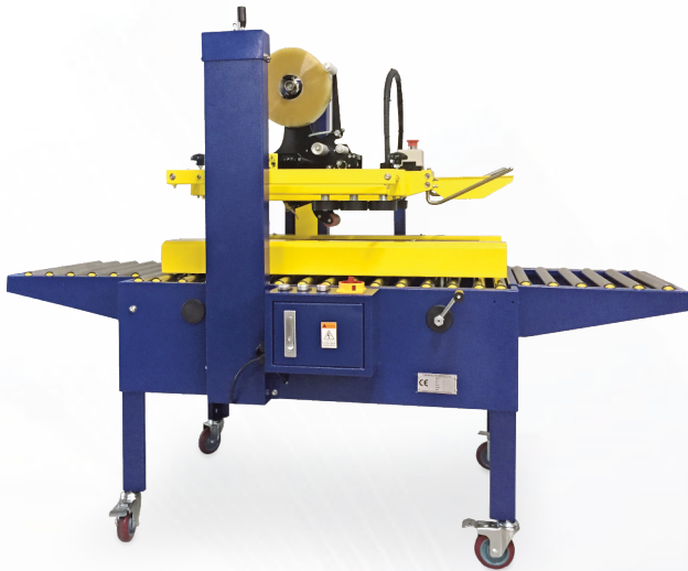
NASTROPACK NP 01 LC EV