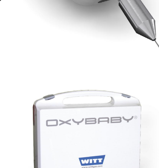
further information on www.oxybaby.com

Please note our variety of accessories on the following pages