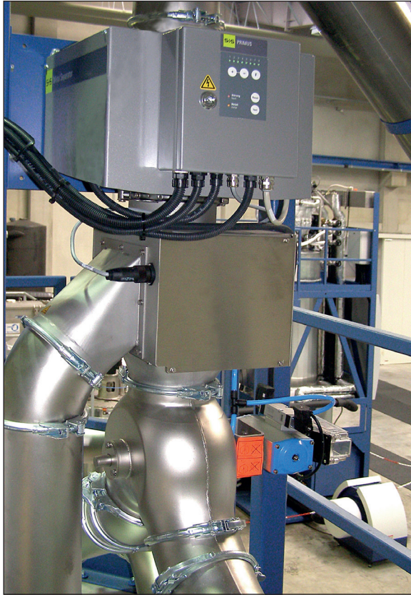
Installation example: Metal separator RAPID VARIO-FS used for the quality control of PET regenerate. (old version)