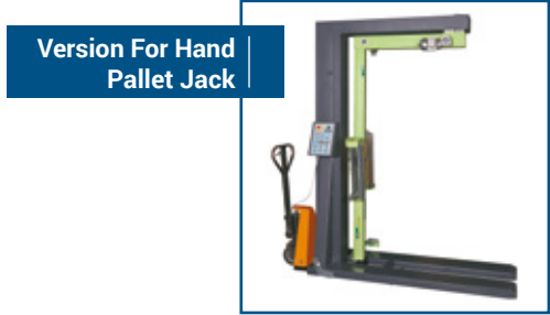
Version For Hand Pallet Jack