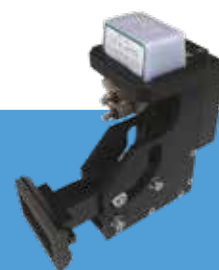
COLD INK PRINTERS