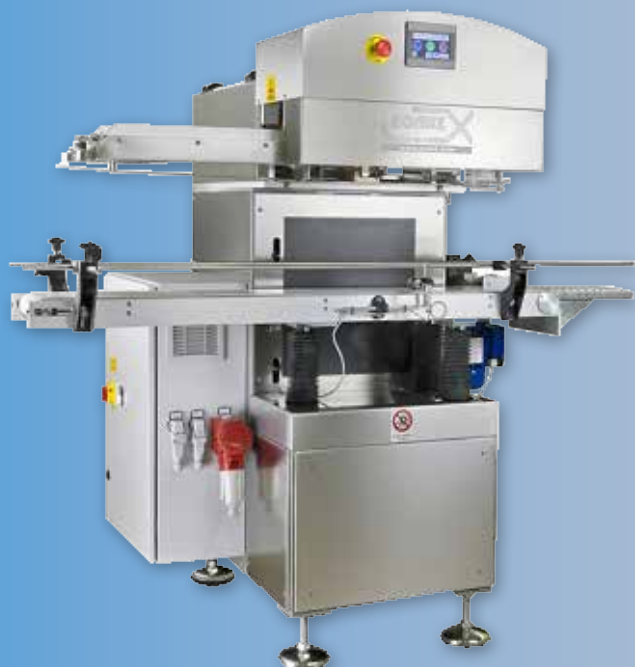
TSA P - TWIST