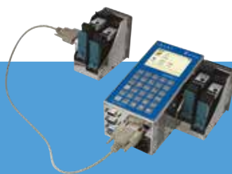
ELECTRONIC INKJET PRINTERS